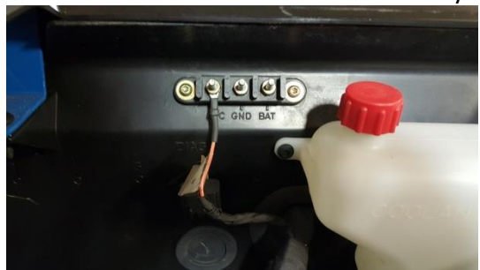
Older Style RZR Busbar

6. Run the red power wire to 12vdc accessory stud under the hood, it can also be hooked up to constant power.