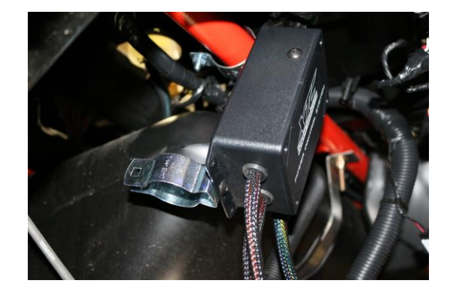
Tighten the first clamp up as much as possible before sliding the unit further over and setting the second clamp to make it easier to do the final tightening.