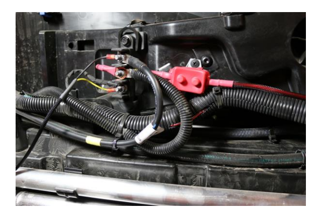
Always use the proper fuse size that the product manufacturer recommends.