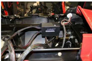
Mount Control Box

STEP 2 Mount the power control unit on the cross bar under the dash with included self tapping screws