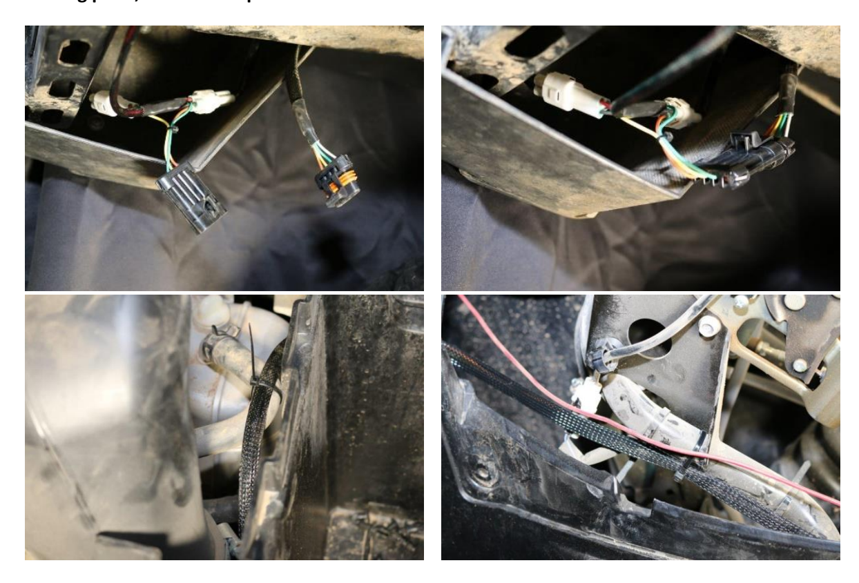
WARNING! Verify that there is clearance before drilling the holes for the LED's and keep the harness away from any hot or moving parts.

5. Run the Rear Harness - Attach the long extension harness to the previously installed rear light harness. Run the rest of the harness with the male four pin connector through the center of the car, through the fire wall at the main wire harness up to the control box and plug into the mating connector, make sure to keep the harness away from any hot or moving parts, secure with provided cable ties.